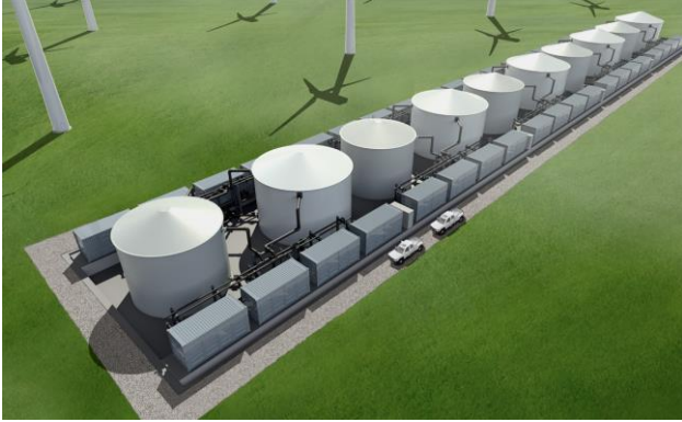
GridStar Flow Rendering – Ariel Shot