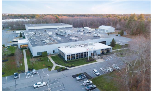
Andover Energy Exterior