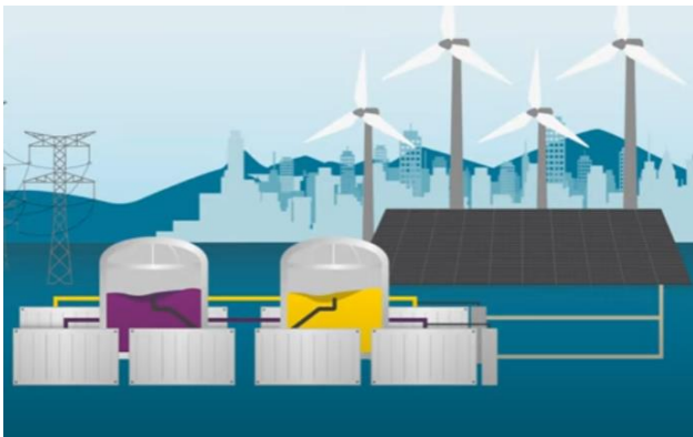
GridStar Flow Animated Video