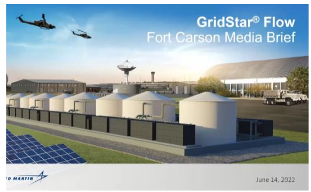
Fort Carson GridStar Flow Media Brief