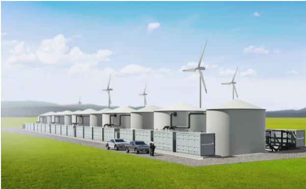
GridStar Flow Rendering – Front View