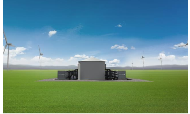
GridStar Flow Rendering – Side View